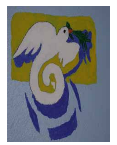
(This art was done by one of our teenage vouth in the Tower room)