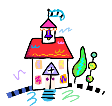
Preschool Open House—March 5, 2011 1-3 PM

be glad to set up a time for you to visit our school. If you wish to register your child, I am available most mornings and Friday afternoons.